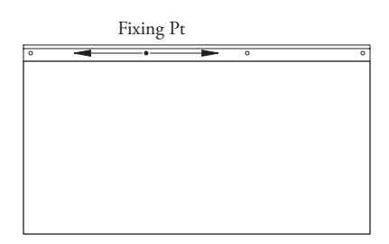
Fig. 2\cdot Each panel should have a single fixing point. The remainder of the holes should be slightly larger than the fasteners.

ings. When installing, ensure that the correct orientation is used for each panel.