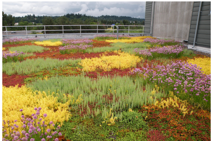
Installed vegetated roof assembly