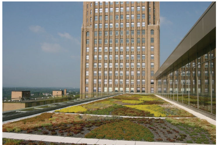
Installed extensive garden roof assembly